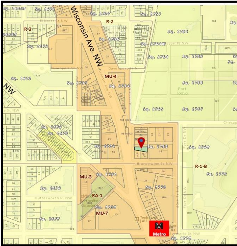
Figure 1: Site Location and Zoning map